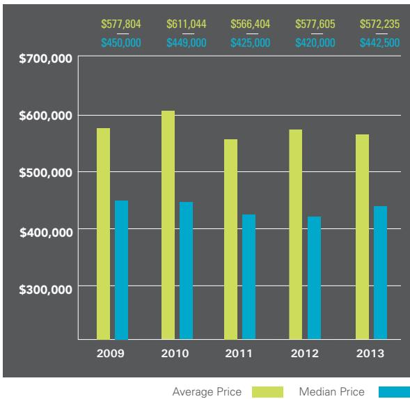
AVERAGE AND MEDIAN SALE PRICE