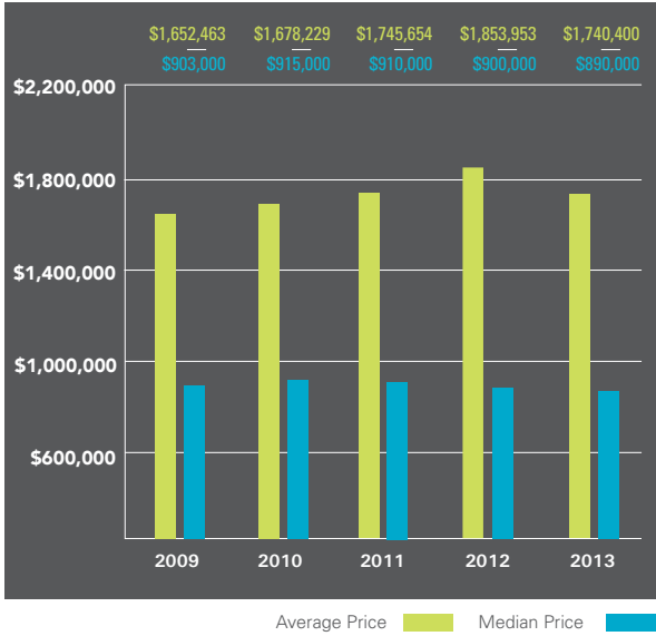
AVERAGE AND MEDIAN SALE PRICE